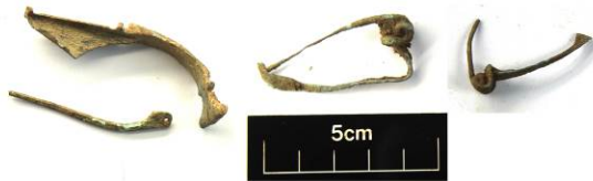
3 of the fibula brooches recovered in 2019

mortaria sherds than before including one almost complete mortarium in a light buff/cream fabric and more amphora sherds some with maker's stamps. As this has proved to be at least a 3 year trench we will have to wait before commissioning the pottery analysis.